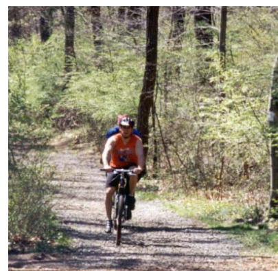
Bike riding on trails in Lewis Morris Park.

For more information about Morris County's park system and some of